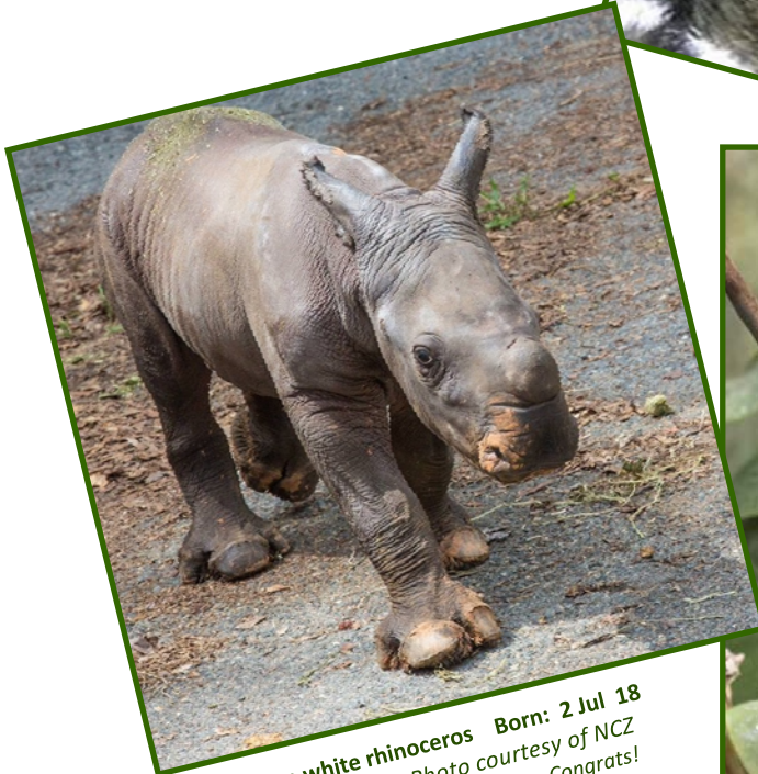
0.1 Southern white rhinoceros Born: 2 Jul 18 North Carolina Zoo First in 41 years at North Carolina Zoo - Congrats!