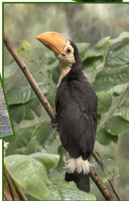
0.0.1 Toco toucan Hatched: 5 Jun 18 Woodland Park Zoo First ever at Woodland Park Zoo - Congrats!