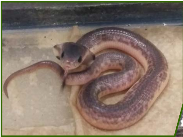
2.3 Black & white spitting cobras Hatched: 25-27 Jun 18 Cincinnati Zoo